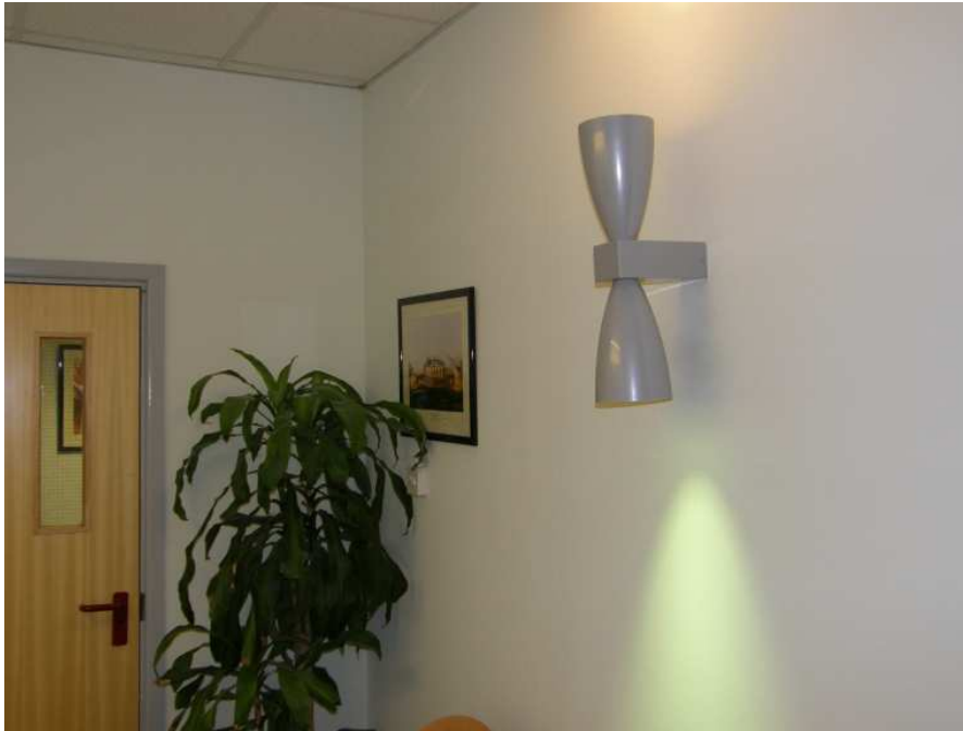
Sovereign® Duo Cone Up/Downlight

Designed around the latest energy efficient miniature metal halide reflector lamps, this stylish British designed and produced wall mounted luminaire provides high quality illumination with added aesthetic appeal. Also available for use with a range of compact fluorescent and LED light sources, with all versions incorporating integral electronic control gear for maximum efficiency. Polyester powder coat finish for a high quality, durable finish in a wide range of BS/RAL colours, including RAL9006 silver and our latest Rust Red textured finish.